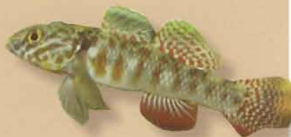
Redfin bully.

There are 7 species of native bully . Unlike the galaxiids they have coped well with humans, remaining fairly widespread and abundant, with only one species regarded as threatened. They are "generalists", occupying all types of aquatic habitat and feeding on a wide range of food.